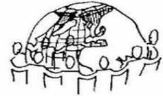
Global seeing & feeling